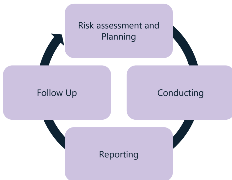
Exhibit 3: The Audit Cycle