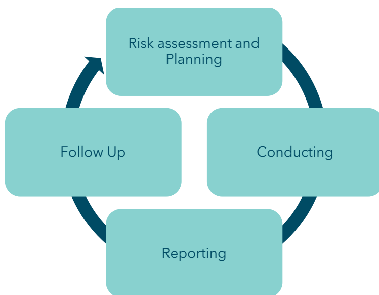
Exhibit 3: The Audit Cycle