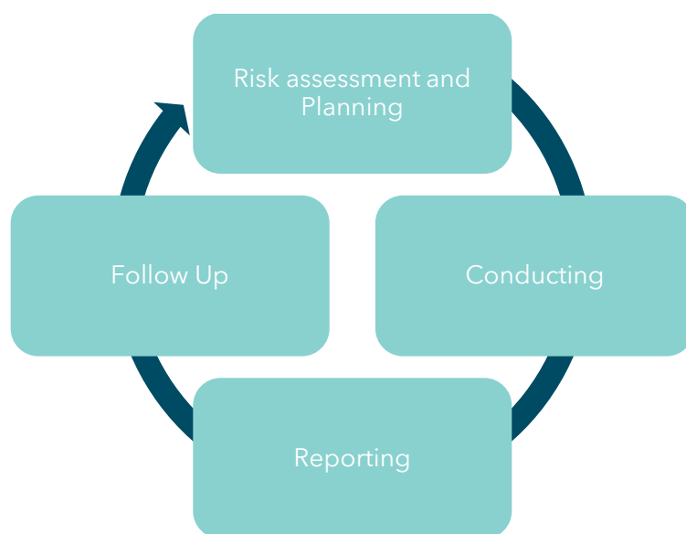
Exhibit 3: The Audit Cycle