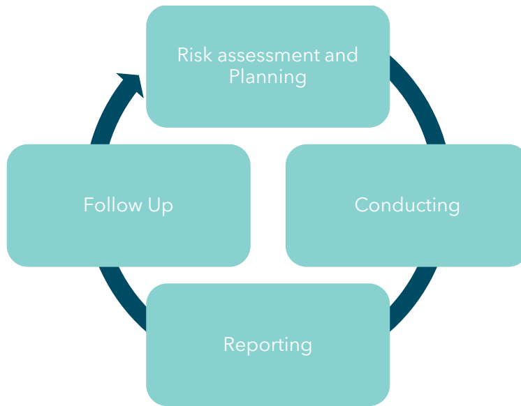
Exhibit 3: The Audit Cycle