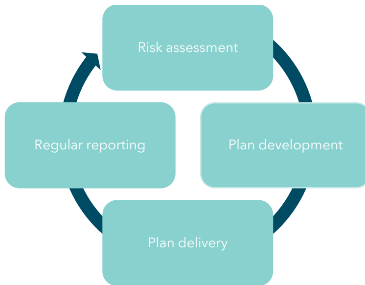
Exhibit 3: The Audit Planning Cycle