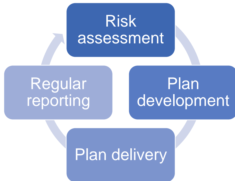
Exhibit 2: The Audit Planning Cycle

3.2 In developing this audit plan I take account of a wide range of risks facing the States of Jersey, including: