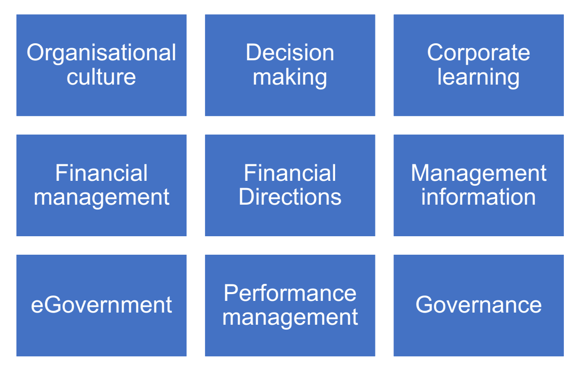
Exhibit 4: Key themes emerging from the work of the Office