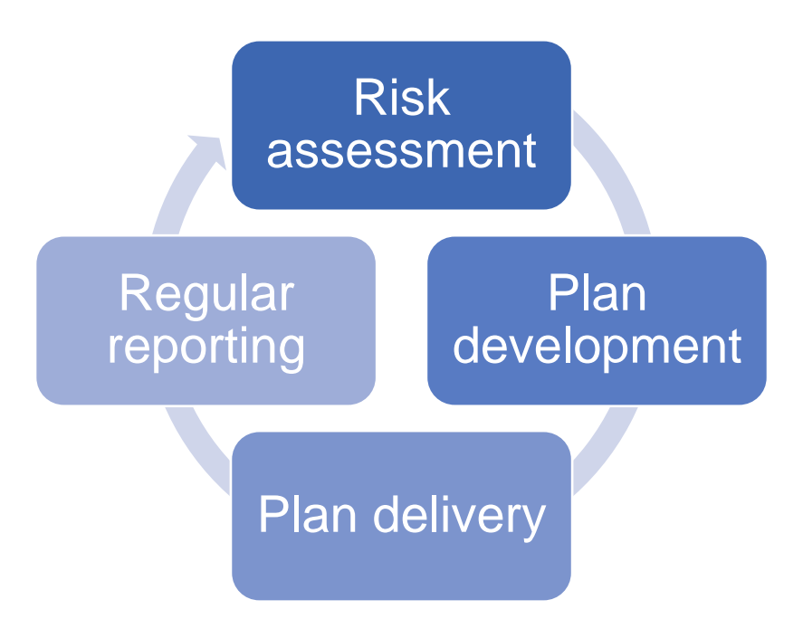
Exhibit 2: The Audit Planning Cycle

3.1 To deliver a proportionate and effective work programme, I plan my work using a risk based approach. There are four key stages to my audit planning cycle (see Exhibit 2).