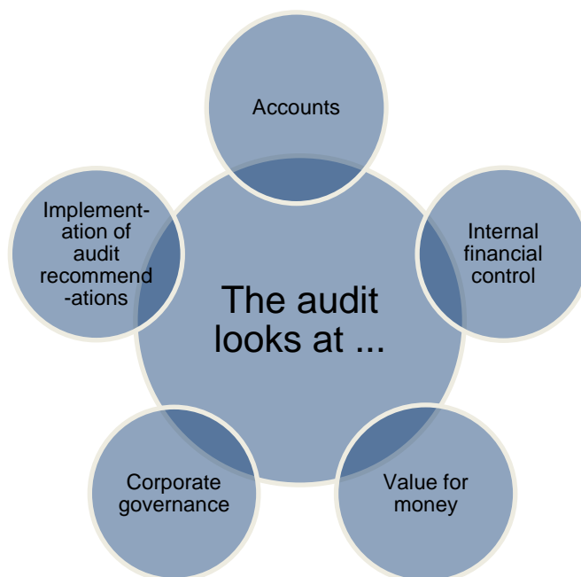
Exhibit 1: The scope of audit work